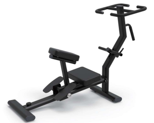
STRETCH BENCH HX-6134 MACHINE SIZE(MM) 1450*510*1020