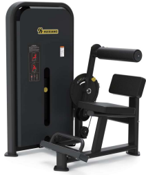
SEATED ABDOMEN TRAINER HX-6111