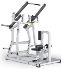
FRONT LAT PULLDOWN TM16 MACHINE SIZE(MM) 1804*1390*1973