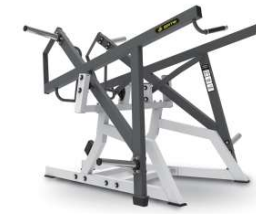
COMBO INCLINE TM64