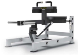
SEATED CALF TM23 MACHINE SIZE(MM) 1224*933*955