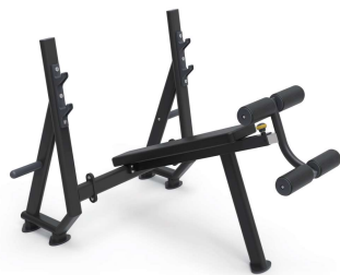
DECLINE CHEST PRESS BENCH HX-6128 MACHINE SIZE(MM) 1750*1600*1210