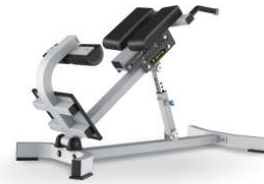
ROMAN CHAIR TM89