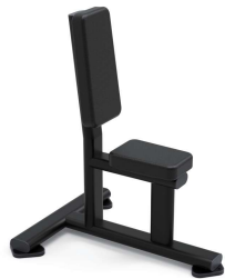
SHOULDER PRESS BENCH HX-6125 MACHINE SIZE(MM) 840*660*1080