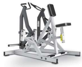
ISO-LATERAL ROW TM06 MACHINE SIZE(MM) 1490*1430*1380