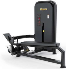
LAT BACK TRAINER HX-6114