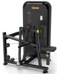
SEATED BACK ROW TRAINER HX-6113