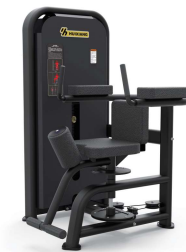
TWIST TRAINER HX-6133 MACHINE SIZE(MM) 1010*1215*1510 WEIGHT STACK(KG) 78