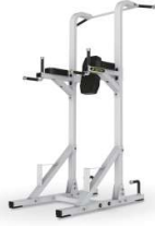
CHIN UP TM100