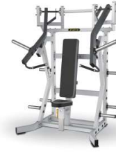
INCLINE CHESS PRESS TM01 MACHINE SIZE(MM) 1640*900*1937