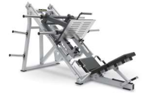
45DEGREE LEG PRESS TM91F