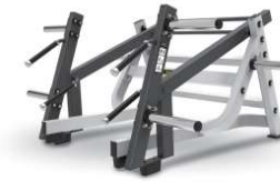
SQUAT LUNGE TM08 MACHINE SIZE(MM) 1358*1617*873