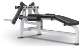
LAYDOWN PECFLY TM48