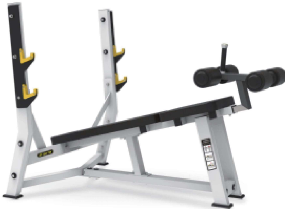
DECLINE BENCH TM47