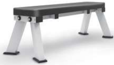
FLAT BENCH TM34