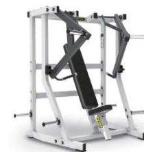
SEATED CHEST PRESS TM26 MACHINE SIZE(MM) 1348*1211*1792