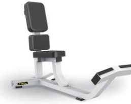
75DEGREE INCLINE BENCH TM51