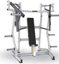
SEATED CHEST PRESS TM04 MACHINE SIZE(MM) 1300*1290*1870