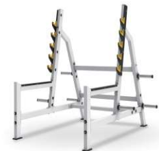
SMITH OLYMPIC SQUAT BENCH TM31 MACHINE SIZE(MM) 1775*1765*1845