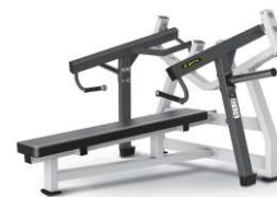
HORIZONTAL PRESS BENCH TM28 MACHINE SIZE(MM) 1785*1781*1096