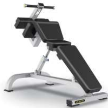
ADJUSTABLE ABDOMINAL BENCH TM45