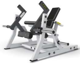
SEATED LEG EXTENSION TM37