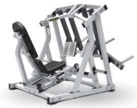
ISO-LATERAL LEG PRESS TM03 MACHINE SIZE(MM) 1770*1690*1500