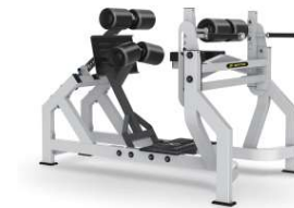
ADJUSTABLE ABDOMINAL/BACK EXTENSION TM93