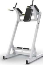
CHIN UP/DIP & KNEE UP TM44