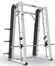
SMITH MACHINE TM09 MACHINE SIZE(MM) 2235*1238*2271