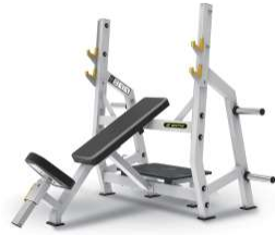
OLYMPIC INCLINE BENCH TM42