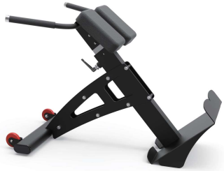
ROME BENCH HX-6123 MACHINE SIZE(MM) 1090*700*780