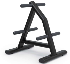
WEIGHT PLATE RACK HX-6130 MACHINE SIZE(MM) 750*570*780