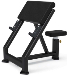
BICEPS BENCH HX-6135 MACHINE SIZE(MM) 755*670*925