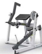
SEATED BICEPS TM29 MACHINE SIZE(MM) 1481*1244*1461