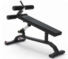
ADJUSTABLE SIT UP BENCH HX-6120