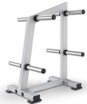
PLATE TREE TM14 MACHINE SIZE(MM) 724*627*1032