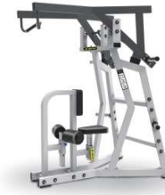
HIGH ROW TM02 MACHINE SIZE(MM) 1610*1530*2010