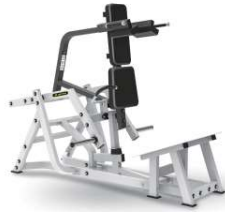
V SQUAT TM71