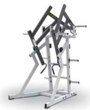
COMBO DECLINE TM65