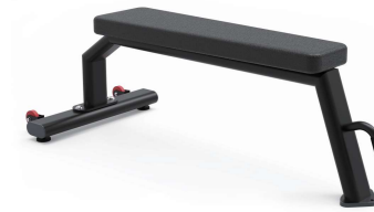
FLAT BENCH HX-6121