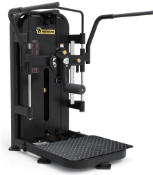
HIP TRAINER HX-6112