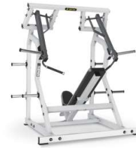
SHOULDER PRESS TM21 MACHINE SIZE(MM) 1854*1358*1886