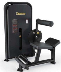
SEATED ABDOMEN&BACK TRAINER HX-6211 MACHINE SIZE(MM) 1200*1100*1510 WEIGHT STACK(KG) 102