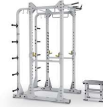
POWER CAGE TM90