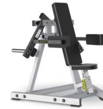
LATERAL RAISE TM58