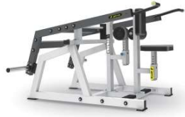
SEATED DIP TM67