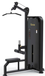
LAT PULL DOWN TRAINER HX-6115