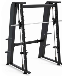
SMITH TRAINER HX-6117