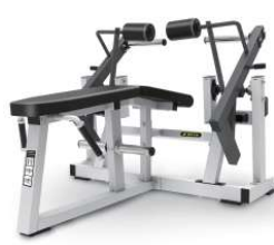
LATERAL LEG CURL TM18 MACHINE SIZE(MM) 1601*1384*996