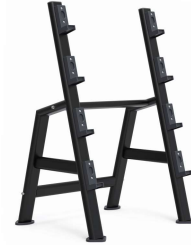
BARBELL RACK HX-6129 MACHINE SIZE(MM) 750*900*1400