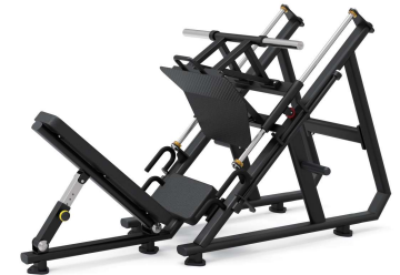
45° INVersed LEG PRESS TRAINER HX-6132 MACHINE SIZE(MM) 2480*1190*1500