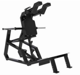
HACK SQUAT RACK HXS-046 MAX LOADING(KG) 300 MACHINE SIZE(MM) 2000*1600*1700 N.W./G.W.(KG) 130/150