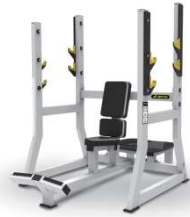
VERTICAL BENCH TM10 MACHINE SIZE(MM) 1748*1245*1663