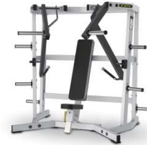
WIDE CHEST PRESS TM07 MACHINE SIZE(MM) 1180*2000*1720