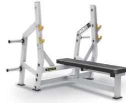
OLYMPIC FLAT BENCH TM38