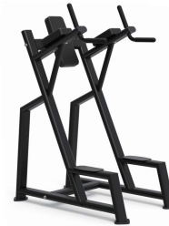
CHIN-UP BENCH HX-6131 MACHINE SIZE(MM) 1160*750*1615