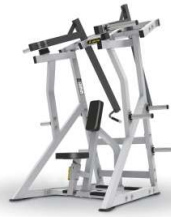
SEATED DUMBBELL ROW TM13 MACHINE SIZE(MM) 1662*1462*2133