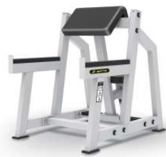
ARM CURL TM20 MACHINE SIZE(MM) 1195*800*1056