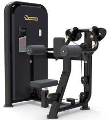
SHOULDER EXTENSION TRAINER HX-6137 MACHINE SIZE(MM) 1010*1150*1510 WEIGHT STACK(KG) 80