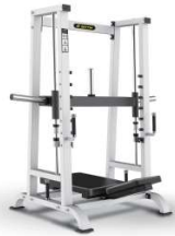
90DEGREE LEG PRESS BENCH TM39