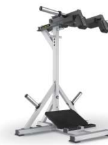
STAND CALF TM80