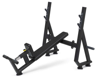
INCLINE CHEST PRESS BENCH HX-6127 MACHINE SIZE(MM) 1745*1460*1310