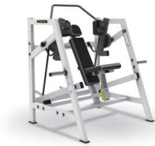
PULL OVER TM68