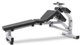
ABDOMINAL BENCH TM75