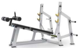
OLYMPIC DECLINE BENCH TM73