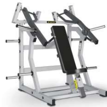
SEATED INCLINE CHEST PRESS TM15 MACHINE SIZE(MM) 1690*1237*1529