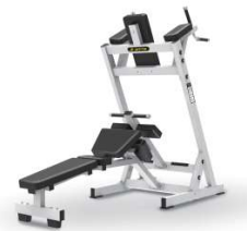
ABDOMINAL WORK STATION TM77