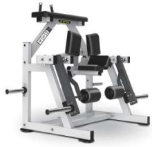
LEG CURL TM66