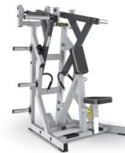
LOW ROW TM25 MACHINE SIZE(MM) 1333*1226*1671