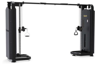
CABLE CROSSOVER TRAINER HX-6118