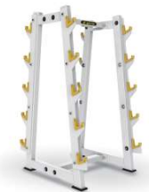
BARBELL RACK TM96