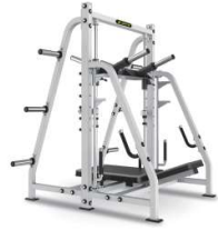
90DEGRESS LEG PRESS TM99