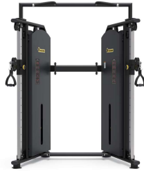
CABLE CROSSOVER TRAINER HX-6138 MACHINE SIZE(MM) 1730*1290*2245 WEIGHT STACK(KG) 78*2