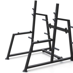
SQUAT RACK HX-6119