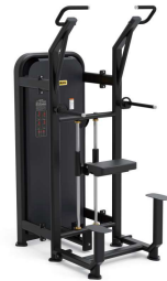
ASSISTED CHIN UP TRAINER HX-6116