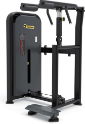
UPRIGHT CALF TRAINER HX-6136 MACHINE SIZE(MM) 1150*1135*1560 WEIGHT STACK(KG) 102