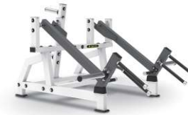
SQUAT HIGH PULL TM22 MACHINE SIZE(MM) 1857*1630*1040