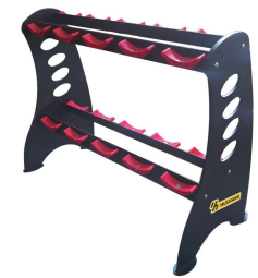
DOUBLE LAYER DUMBBELL RACK HX-6122