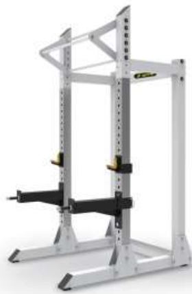
POWER RACK TM102