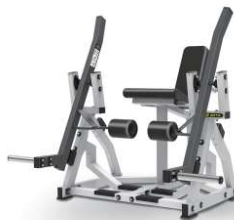
LATERAL LEG EXTENSION TM17 MACHINE SIZE(MM) 1518*1462*1488