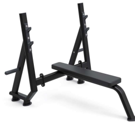
FLAT CHEST PRESS BENCH HX-6126 MACHINE SIZE(MM) 1650*1460*1210