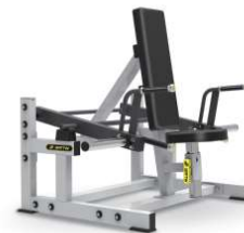
SEATED STANDING SHRUG TM76