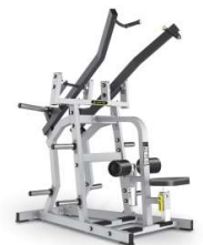
WIDE PULLDOWN TM27 MACHINE SIZE(MM) 1754*1245*1792