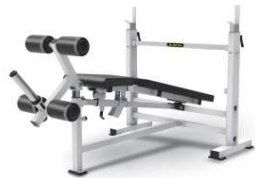
MULTI BENCH TM46