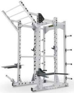
POWER CAGE TM101