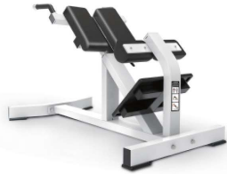
BACK EXTENSION TM11 MACHINE SIZE(MM) 1359*736*925