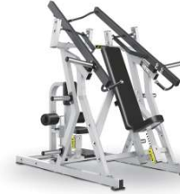
SEATED CHEST PRESS/LAT PULLDOWN TM05 MACHINE SIZE(MM) 2070*1690*2030