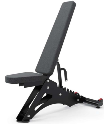
ADJUSTABLE DUMBBELL BENCH HX-6124 MACHINE SIZE(MM) 1425*570*470