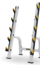
BAR RACK TM61