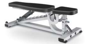
ADJUSTABLE BENCH TM87