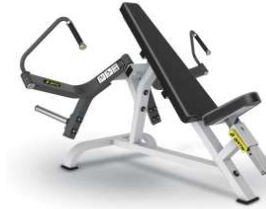
INCLINE PECFLY TM56