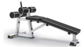
DECLINE BENCH TM55